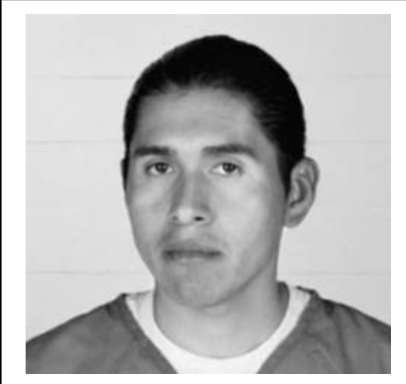
"Sexual abuse is never your fault"