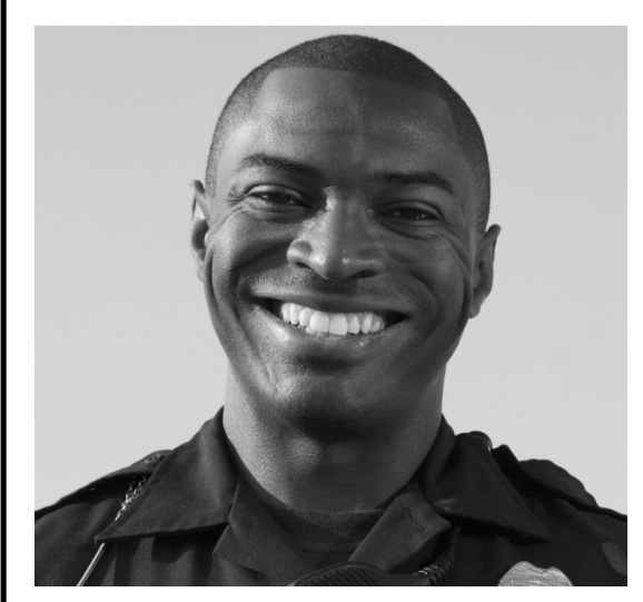
"VADOC cares about your safety"

Remember, don't blame yourself. If someone abuses you, it is not your fault!