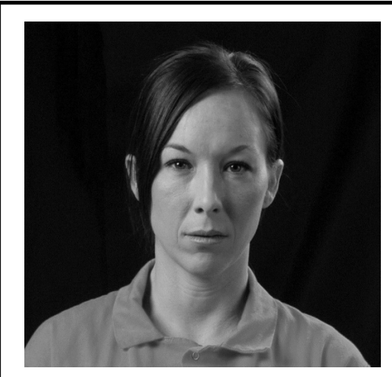
"Reporting protects us all"